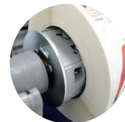
Rewinding to finished rolls