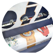
Waste matrix removal