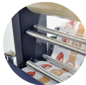
Laminating (SCR22PL and SCR35PL only)