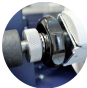
Core holder's clutch