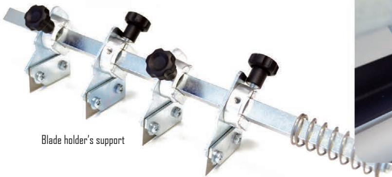
Blade holder's support