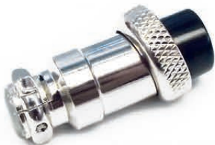
Connector to use the slitter on-line with your label printer

L: 28.34" H: 14.56" W: 16.73" Weight: 55 lbs